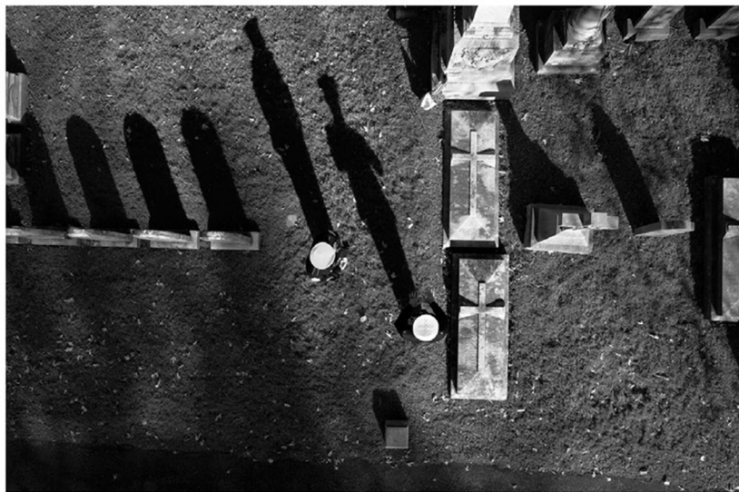
Wreath laying, 2013

By creating these images, I aim to draw attention to the changing nature of personal privacy, surveillance, and contemporary warfare. Underpinning my work is a belief that human activity becomes increasingly absurd and dangerous when it loses empathy. I agree with Albert Camus when he said, “By definition, a government has no conscience. Sometimes it has a policy, but nothing more.”